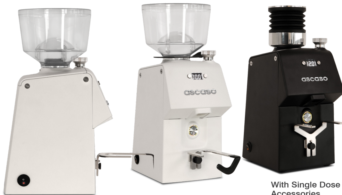
With Single Dose Accessories