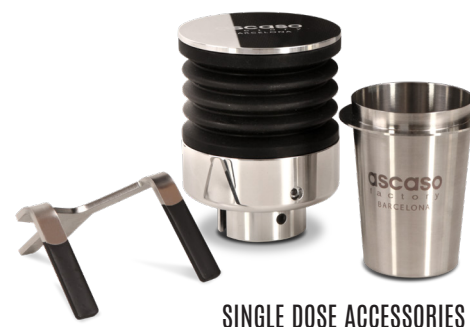
SINGLE DOSE ACCESSORIES

Enhanced antistatic system that prevents coffee from adhering to the metal walls. Ensure consistency in every service.